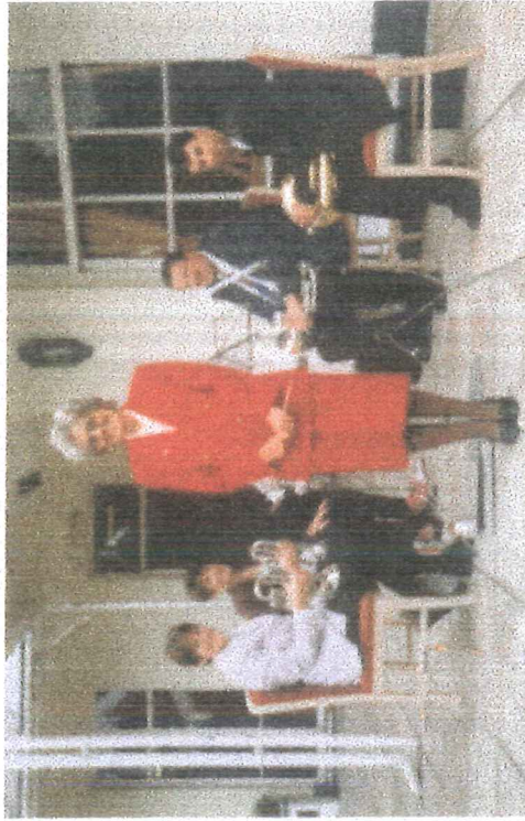
Spectrum Brass Quartet at the Lakeside Moat House (Sep. '98)

The Quartet started three years ago when four musicians and a conductor wished to improve their skills by entering competitions. The quartet first competed at Godalming in 1996 becoming the champions of that Southern Counties Quartet Contest. In 1999 they will be defending their title as London & Home Counties Quartet Champions, making them the most successful brass quartet in Essex.